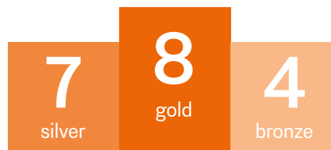
# Olympic medals Summer Olympics Rio de Janeiro 2016

Sport and physical activity have become prominent tools in governmental health policy in the Netherlands. The sports mission of the Ministry of Health, Welfare and Sport is to make it possible for everyone to play sports. Sport promotes health, provides social contacts and contributes to self-development. In addition, the Ministry focuses on, and funds top level sports, so that the Netherlands can perform well at international tournaments.