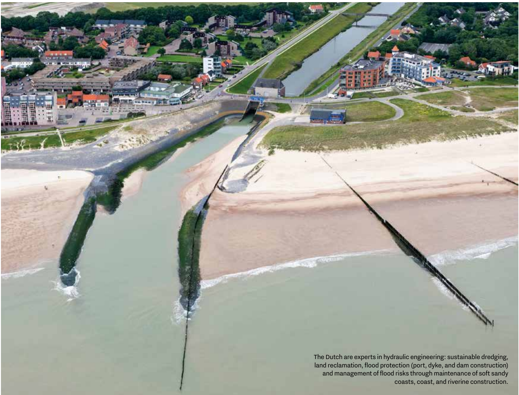
The Dutch are experts in hydraulic engineering: sustainable dredging, land reclamation, flood protection (port, dyke, and dam construction) and management of flood risks through maintenance of soft sandy coasts, coast, and riverine construction.