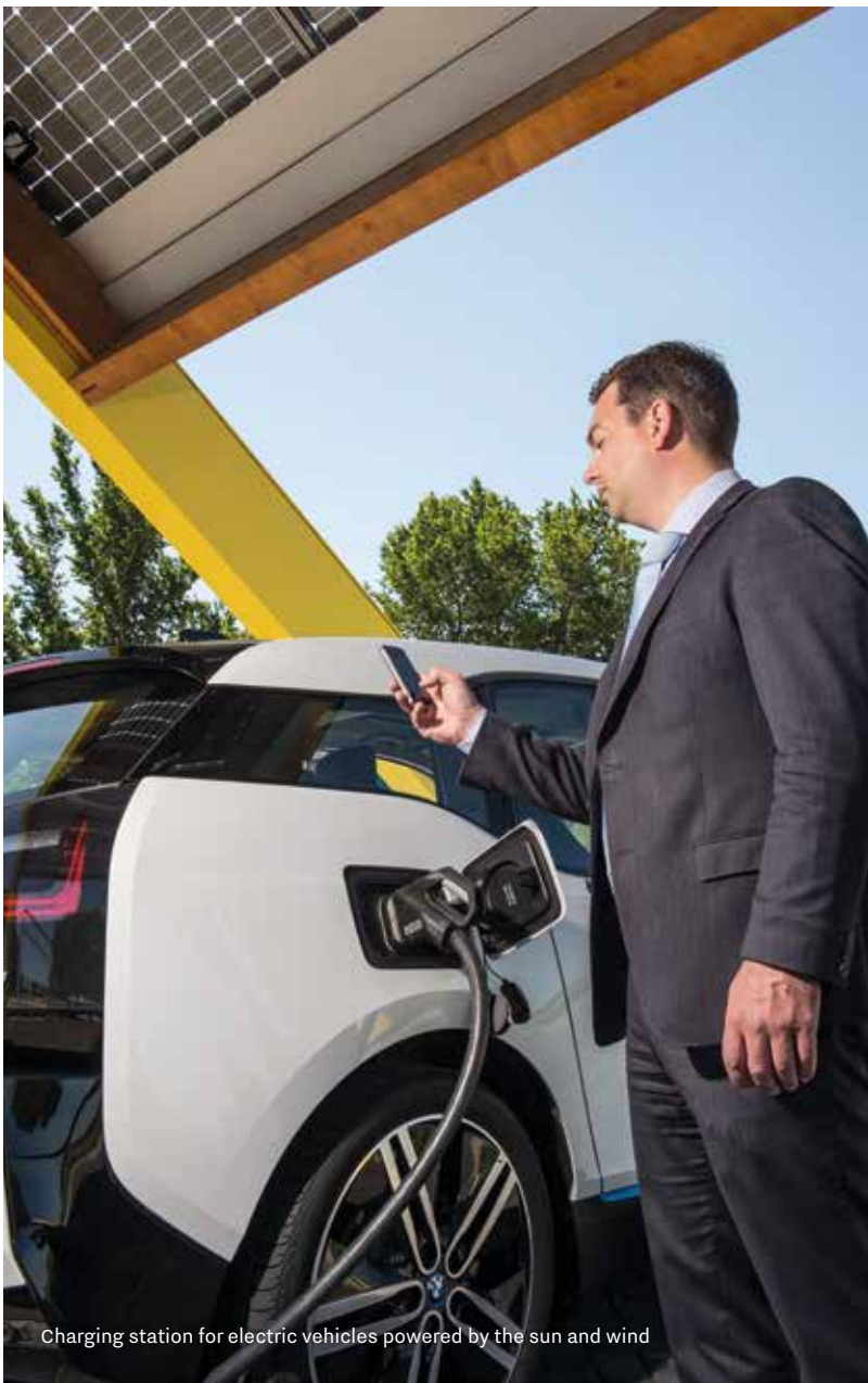
Charging station for electric vehicles powered by the sun and wind