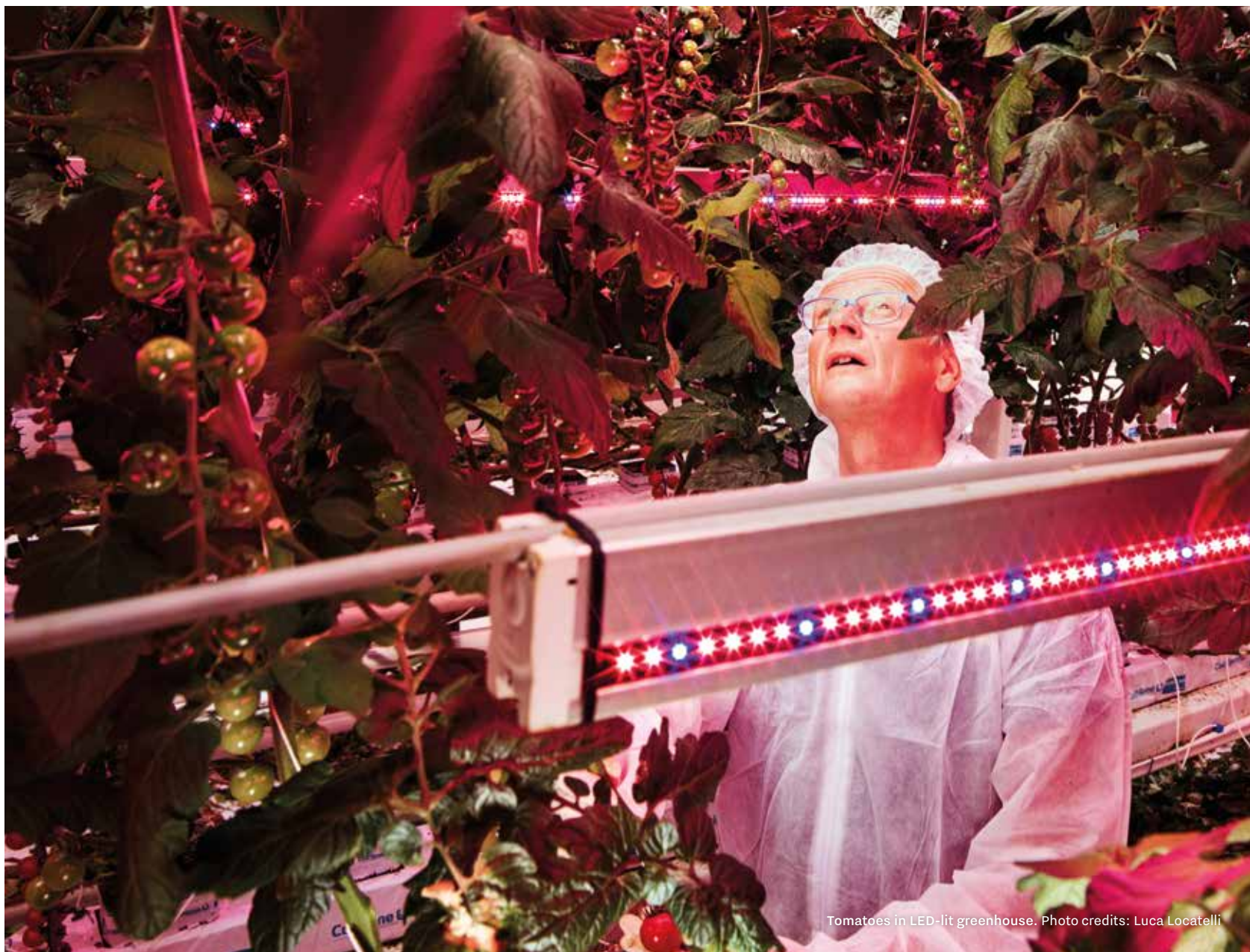
Tomatoes in LED-lit greenhouse.