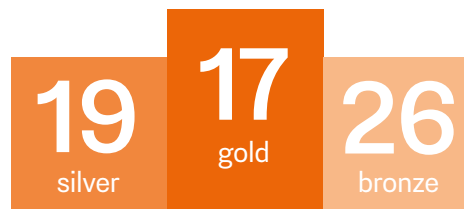
# Olympic medals Summer Paralympics Rio de Janeiro 2016