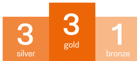
# Olympic medals Winter Paralympics PyeongChang 2018